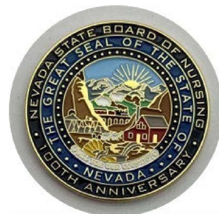
Image from: https://nevadanursingboard.org/message-from-the-executive-director/

://nevadanursingboard.org/practice-information/